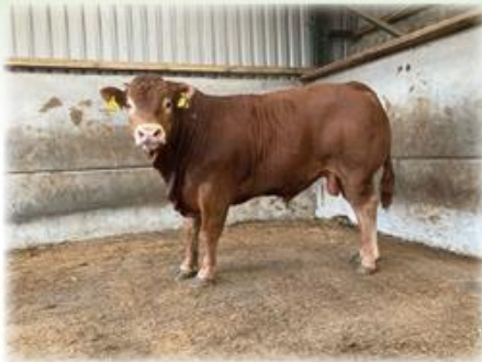
Calvert Star D.O.B 07.04.21