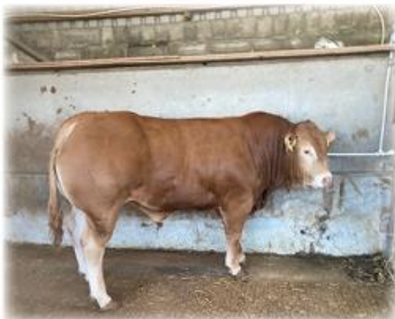
Calvert Sasho D.O.B 25.03.21