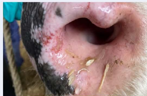
Ulceration in nostrils