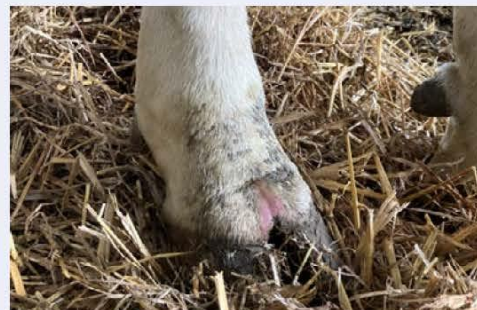
Red interdigital cleft