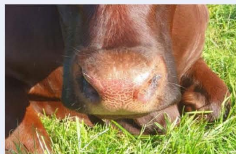
Crusting around nostril