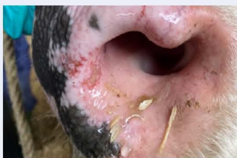
Ulceration in nostrils