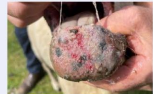
Ulcers and lesions in the mouth