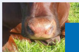
Crusting around nostril

Find out more information and how to report bluetongue by visiting www.gov.uk/bluetongue