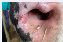
Ulceration in nostrils