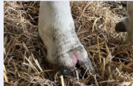
Red interdigital cleft