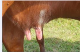
Reddening and erosions on the teats