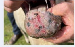
Ulcers and lesions in the mouth