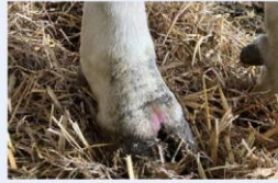
Red interdigital cleft