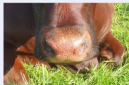
Crusting around nostril