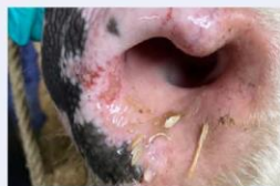
Ulceration in nostrils